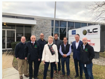
Business Ambassador visit at Graphic Innovators