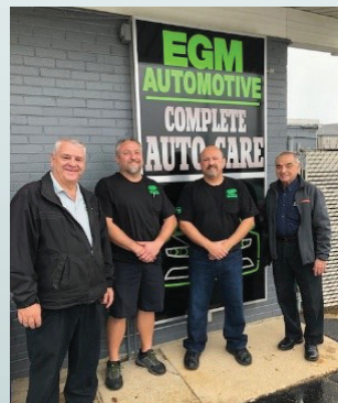
Business Ambassador visit at EGM Automotive