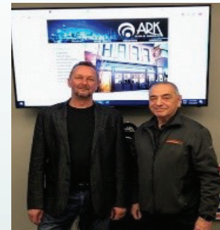
Business Ambassador visit at Ark Glass of Chicago