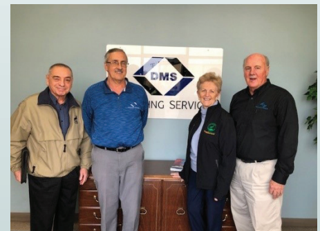
Business Ambassador visit at DMS Packing Services