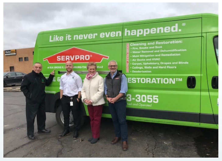
Business Ambassador visit at Servpro