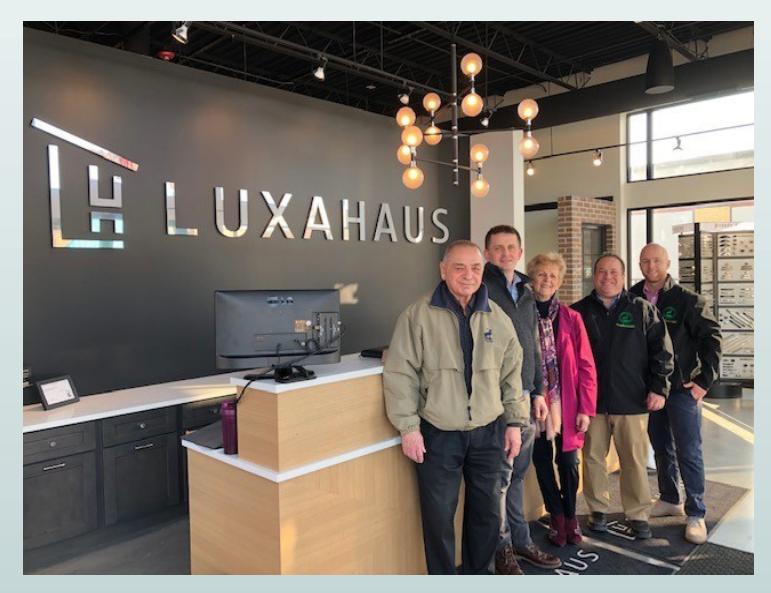
Business Ambassador visit at Surfaces by Pacific