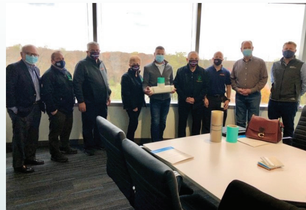
Business Ambassador visit at Waterline Renewal Technologies