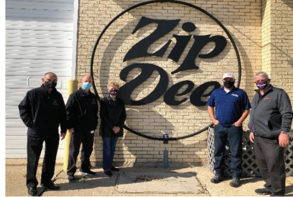
Business Ambassador visit at Zip Dee