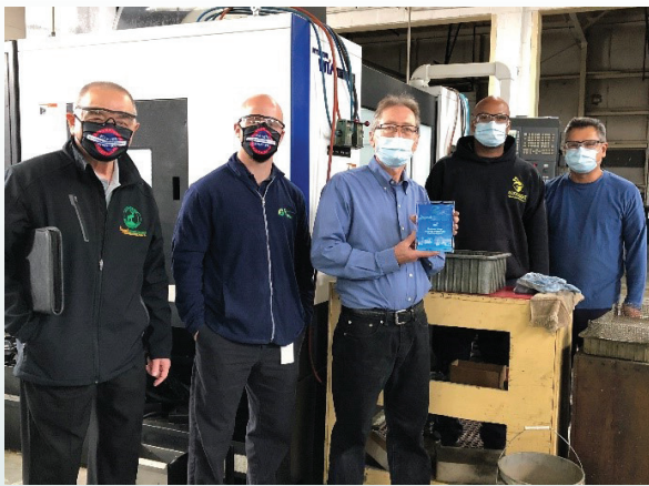
Business Ambassador visit at White Racker