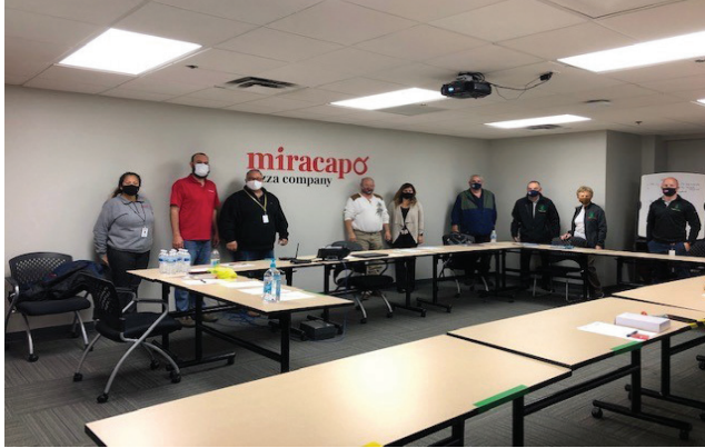
Business Ambassador visit at Miracapo Pizza