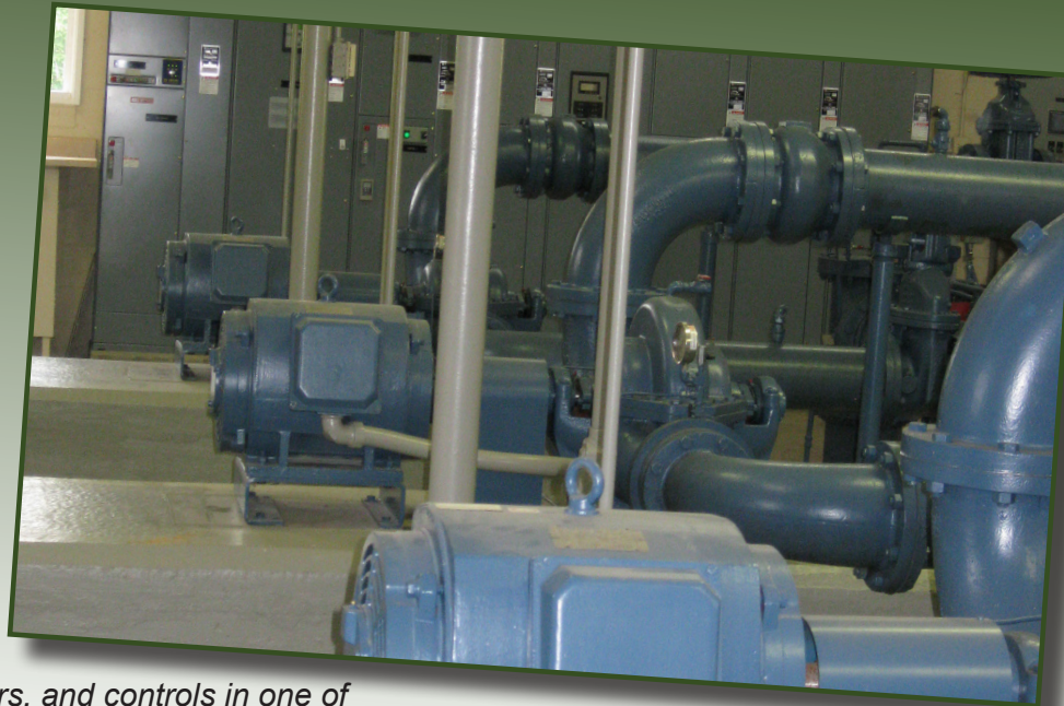
Pumps, motors, and controls in one of the Village's pumping stations.