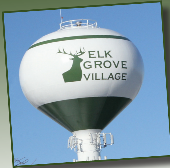
Elk Grove Village water tower design selected as the winner of the Illinois Section AWWA 2014 Tank Photo Contest.