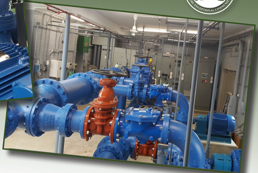
Pumps, motors, and piping in one of the Village's rehabilitated pumping stations.