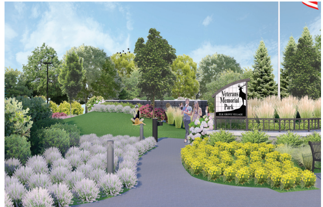
Veterans Memorial Park Biesterfield Road Perspective

Renovations to the Clock Tower and Veterans Memorial Park are funded through the Residential Enhancement Fund. Established in 2001, the Residential Enhancement Fund provides dedicated resources for continuous enhancement to public areas of the Village, including addressing aging infrastructure and reinvesting in shared public spaces. ■