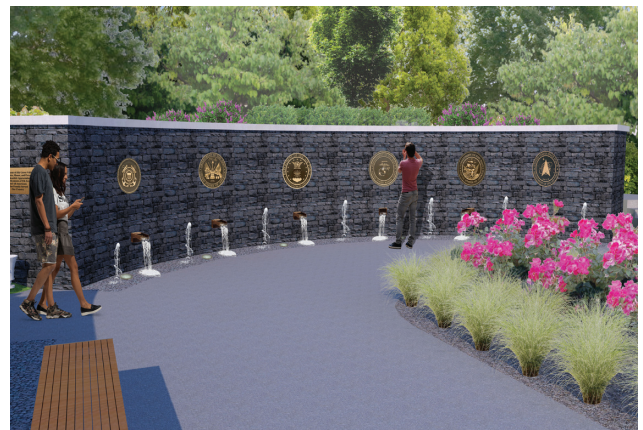
Veterans Memorial Park Memorial Wall and Fountain Design