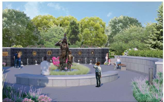
Veterans Memorial Park Perspective Fallen Soldier Statue