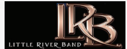
Chart topping hits... "Reminiscing", "Lady", "Cool Change", "Lonesome Loser", "The Night Owls", "Take It Easy On Me", "Help Is On Its Way", "Happy Anniversary", "We Two", "Man On Your Mind", "The Other Guy", and "It's A Long Way There"

Tuesday, July 12 at 7:30 p.m. - Village Green