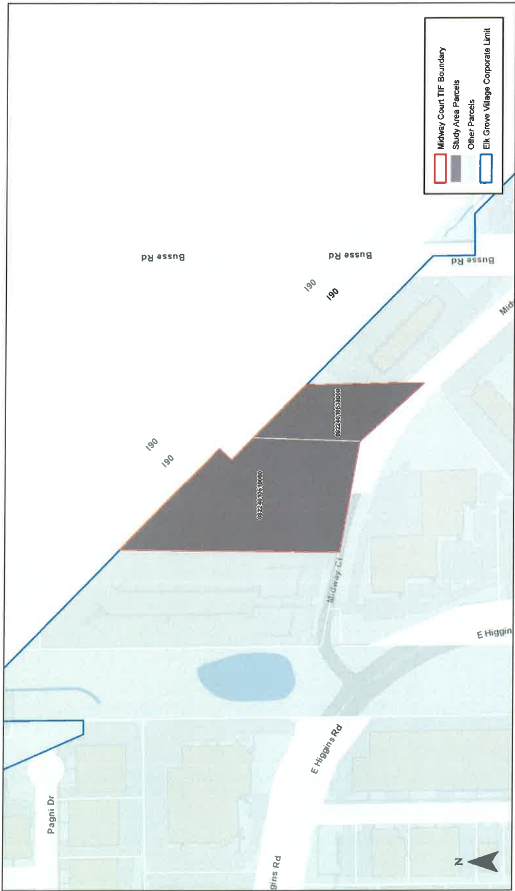
Figure 1 : Redevelopment Project Area Boundary Elk Grove Village Midway Court TIF Redevelopment Plan and Project