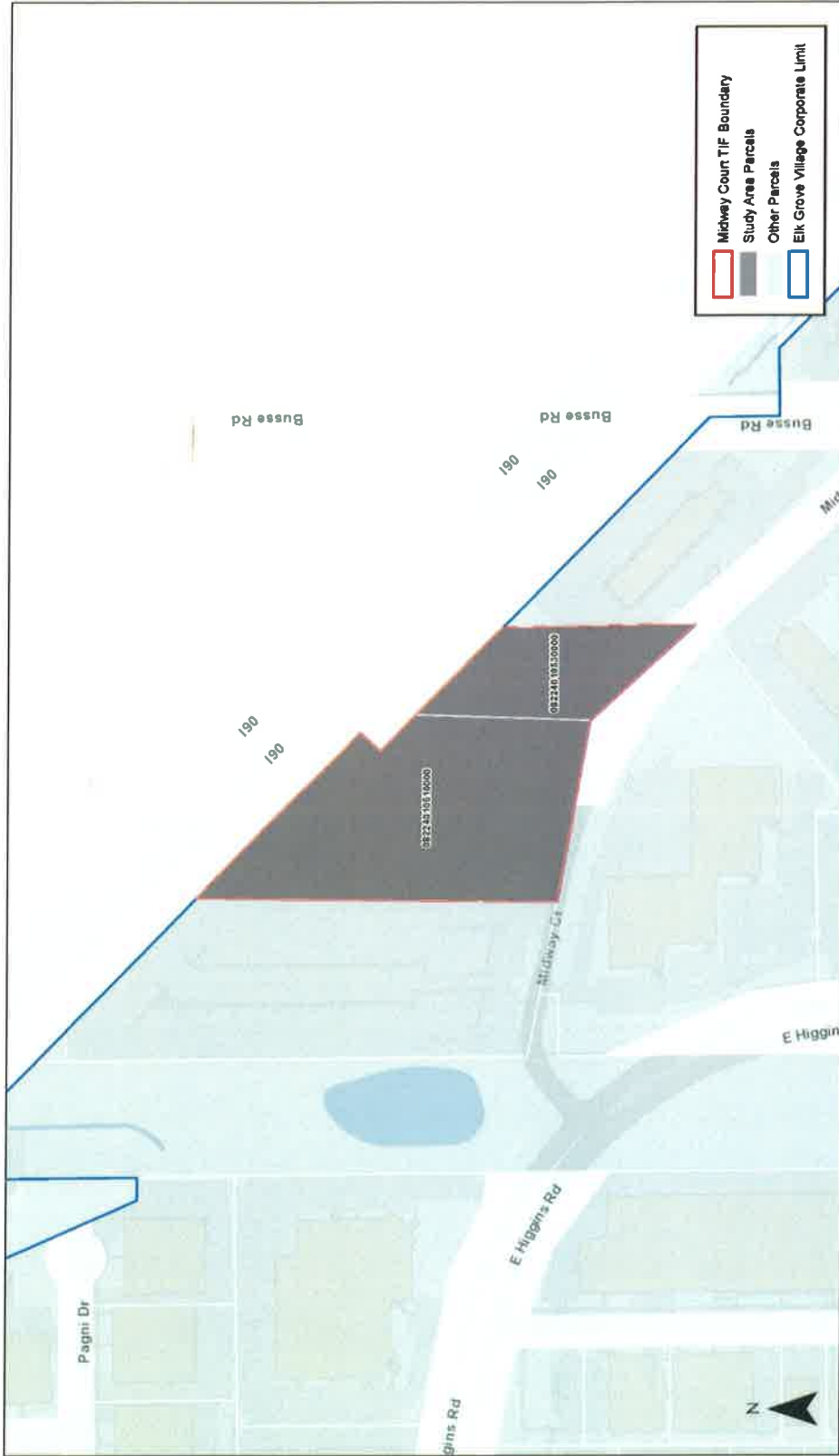
Figure 1 : Redevelopment Project Area Boundary Elk Grove Village Midway Court TIF Redevelopment Plan and Project