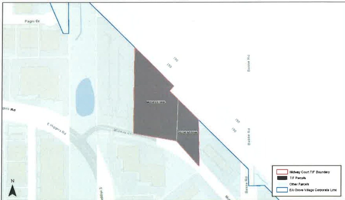
Figure A : Study Area Elk Grove Village Midway Court TIF Redevelopment Plan and Project

The Project Area includes two improved industrial tax parcels. A concrete recycling facility currently operates on the site. There are three building structures on the two tax parcels, including a brick office building, a construction trailer and a metal building that appears to have been constructed using shipping containers that have been welded together. Piles of construction materials occupy most of the land within the Study Area.