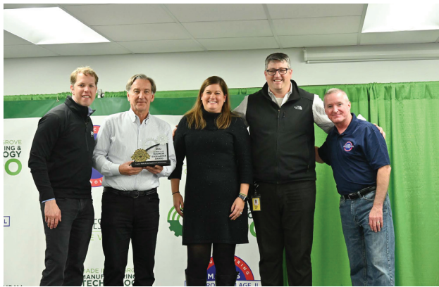
Excellence in Sustainability Creative Werks LLC