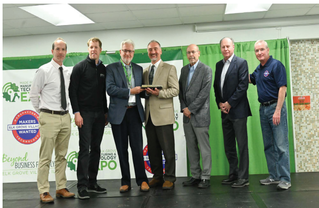
Industrial Development of the Year Steiner Electric