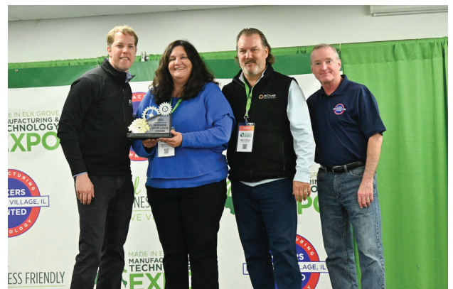
Excellence in Community Support Acme Industries