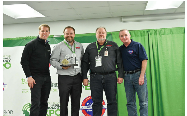
Excellence in Innovation Broetje Automation - USA