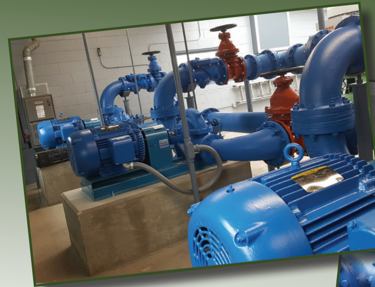
Pumps, motors, and piping in one of the Village's rehabilitated pumping stations.