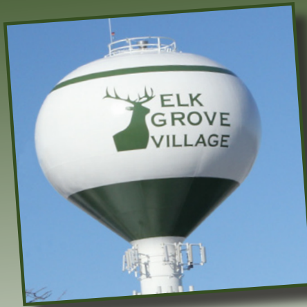
Elk Grove Village water tower design selected as the winner of the Illinois Section AWWA 2014 Tank Photo Contest.