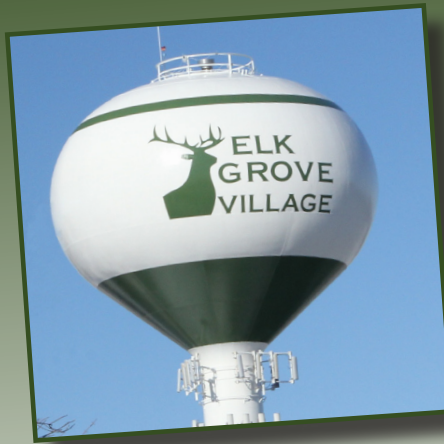
Elk Grove Village water tower design selected as the winner of the Illinois Section AWWA 2014 Tank Photo Contest.