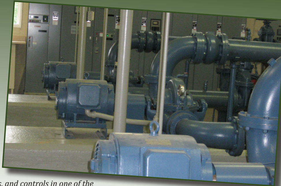
Pumps, motors, and controls in one of the Village's pumping stations.