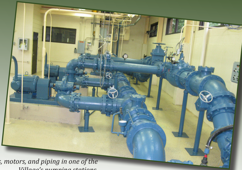
Pumps, motors, and piping in one of the Village's pumping stations.