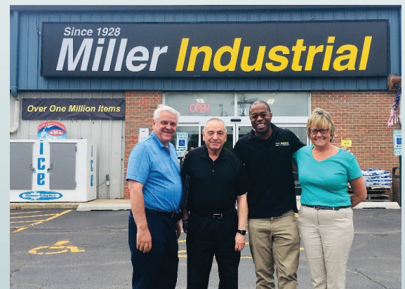
Business Ambassador visit at Miller Industrial