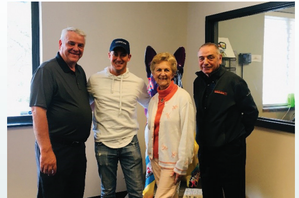
Business Ambassador visit at Norman Distribution