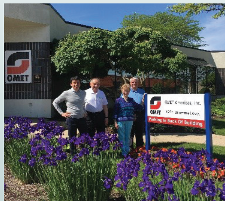
Business Ambassador visit at OMET Americas