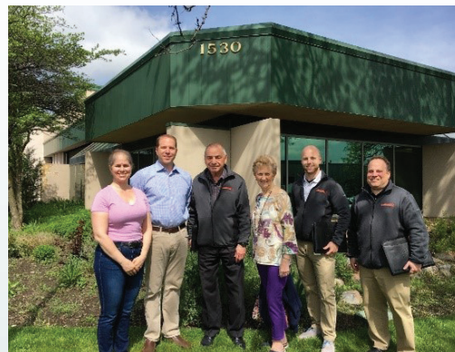
Business Ambassador visit at Active Glass/Pittco

Village Board meetings are generally held on the second and fourth Tuesday of the month at 7:00 p.m.