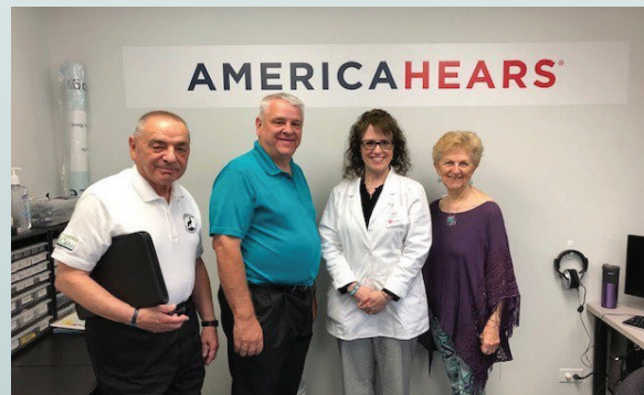
Business Ambassador visit at America Hears