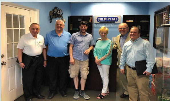
Business Ambassador visit at Chem-Plate