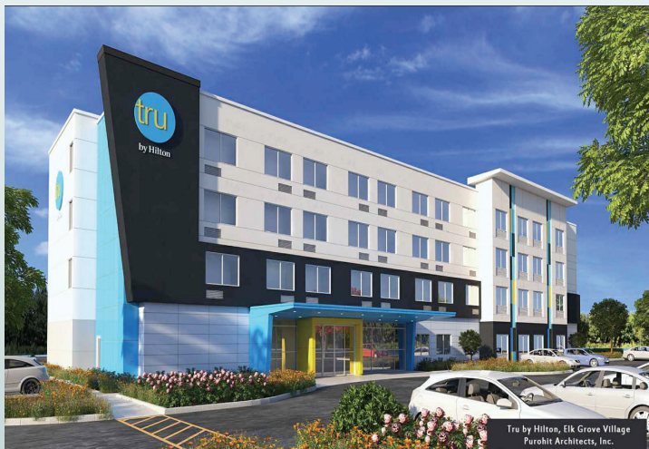
Tru by Hilton

The purchase of the former Elk Grove Hotel site was made using funds from the Busse/Elmhurst Tax Increment Financing (TIF) District. The Busse/Elmhurst TIF was created in 2014 to spur private investment and development in blighted and underutilized areas. Tax Increment Financing freezes the assessed value of property within a designated area (or “district”) so that new money generated can be used for uses such as promoting redevelopment. Private investment and redevelopment revitalizes and grows the Village’s tax base to ensure the future financial security of the community.