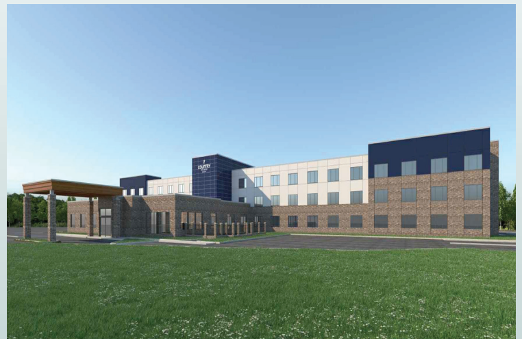
Country Inn & Suites